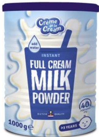
Creme De La Cream Dutch Milk Powder