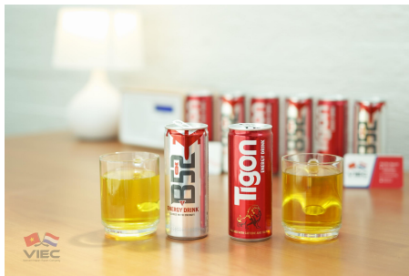
B52 and Tigon Energy Drinks from Holland