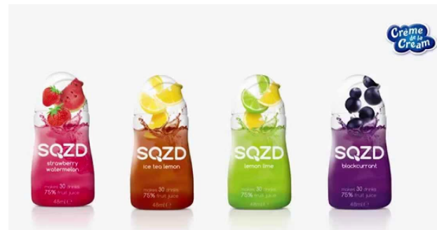
Dutch No added sugar Fruit syrup