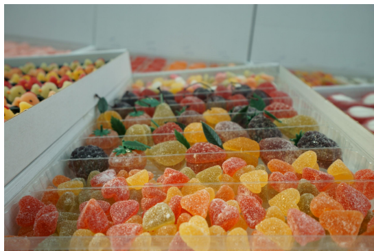
Sweet Amsterdam soft candies from Holland