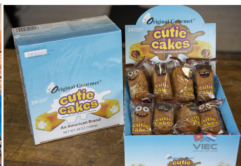
Original Gourmet Cream-Filled Blizzard and Cutie Cake