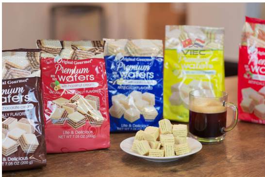
OGFC Cakes and Waffle from USA