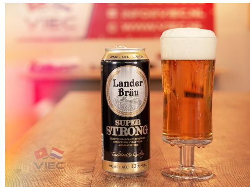
Lander Brau Beer From Royal Swinkel Family Brewer