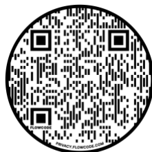
My Food as Medicine story