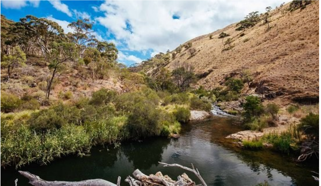
Werribee Gorge - Victoria