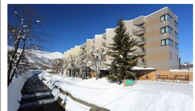
Moderate: Hotel Hakuba