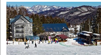
Basic: Hakuba Sunvalley Hotel