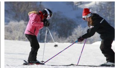
Lesson with English Speaking instructor