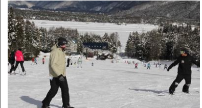
Hakuba Goryu Iimori Resort