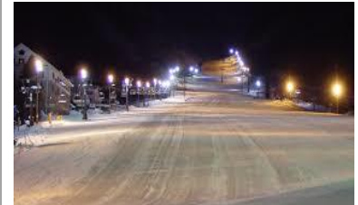
Hakuba Goryu Ski Resort