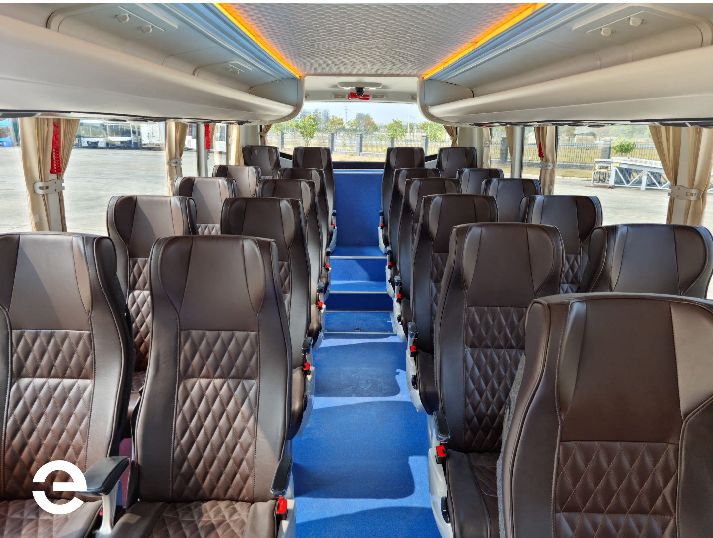
Interior, coastline design concept, rear view