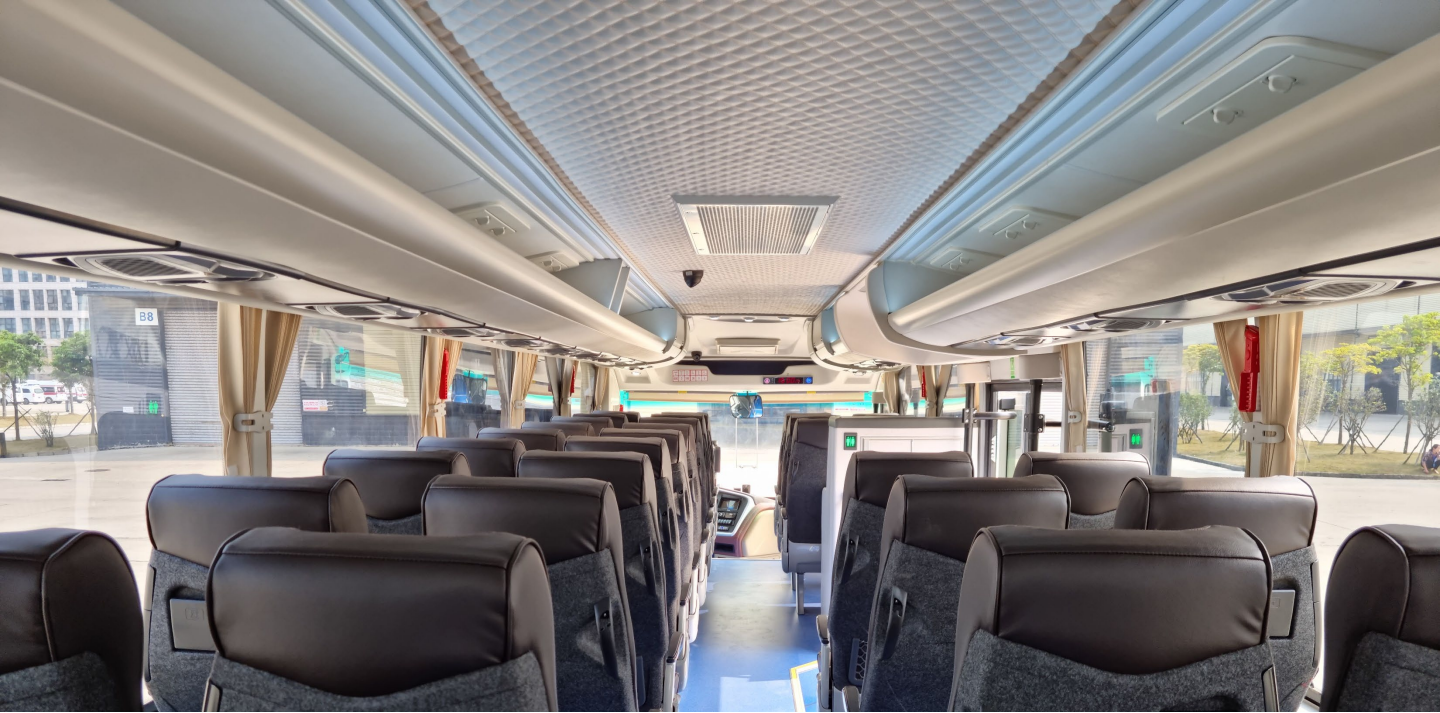
Interior, coastline design concept, front view